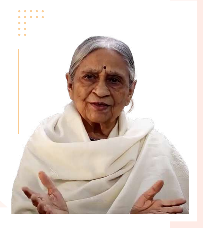
"Home-based workers around the world face the same issues," said Ela Bhatt at the HomeNet International Founding Congress, on February 23, 2021.

These were the guiding words that Sister Ela Bhatt, the founder of the home-based workers' movement and the largest informal economy trade union of women workers (SEWA) in India, shared with HomeNet International during the HNI Founding Congress held virtually on February 23, 2021.