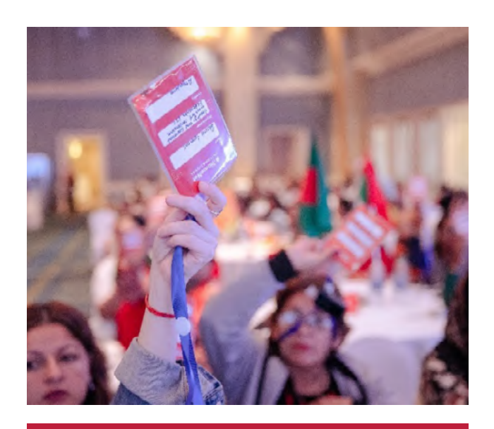
All delegates raised their badges as a unanimous sign of endorsement of the first HNI Resolution

Suntaree read out HNI's first Resolution, in solidarity with Elizabeth Tang, General Secretary of the International Domestic Workers' Federation (IDWF) who was arrested by the Chinese National Security Police under allegations of endangering national security, but at the time of the HNI Congress remained out on bail.