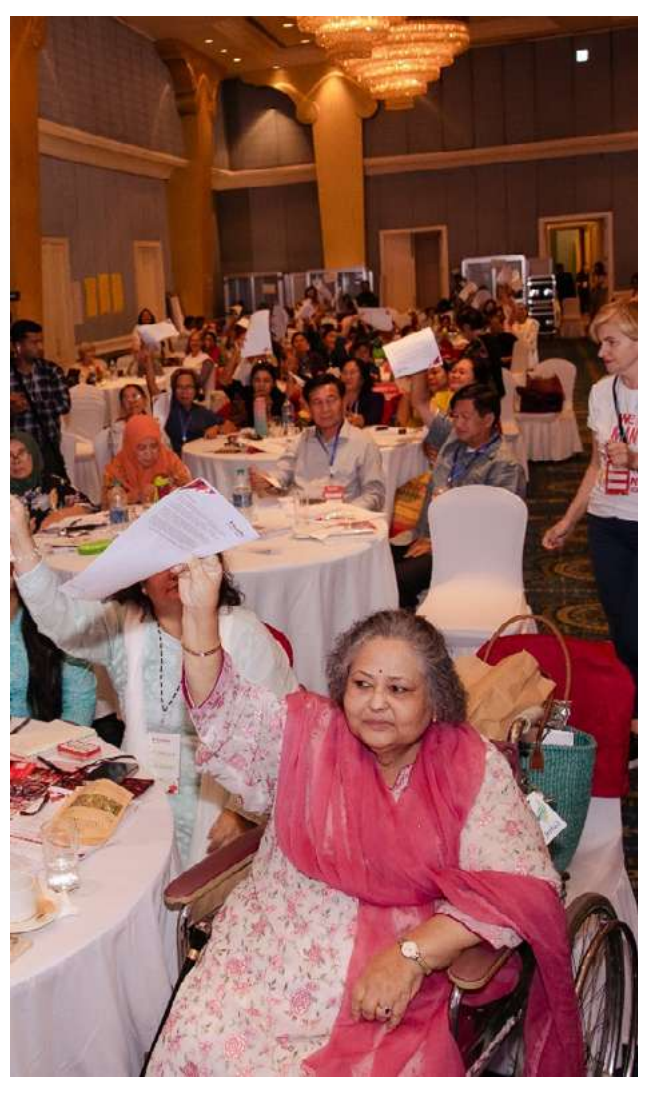
Participants raise the draft Declaration to show their support for it